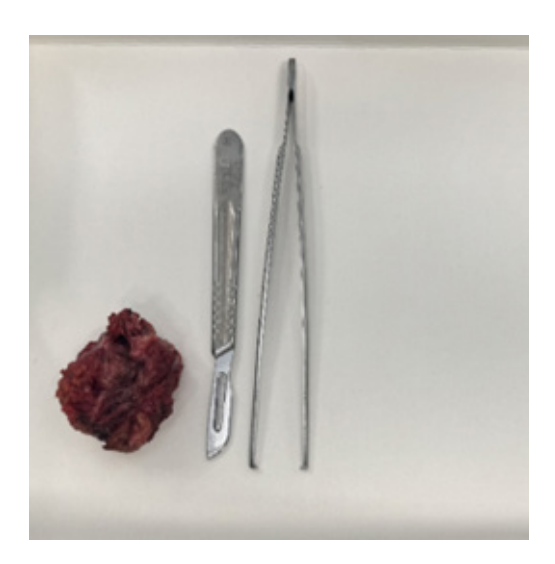
Figure 3: Image showing the endometrioma after resection.