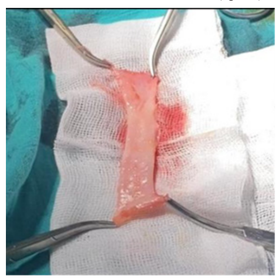
Figure 2: folded muscle sleeve.

The musculoserosal sleeve is obtained by folding the musculoserosal flap over itself, which is then fixed by separate stitches with 3/0 absorbable sutures. The muscular side is on the outside. (figure 2).