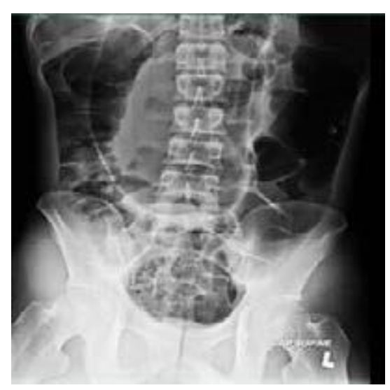
Figure 2: Abdominal x-ray showing dilated small and large bowels with the loss of haustration