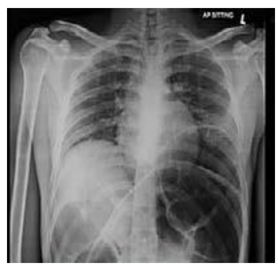
Figure 1: chest x-ray showing dilated bowels occupying the left hemi-diaphragm