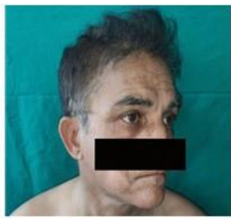
Figure 1: Pre-Operative Photographs