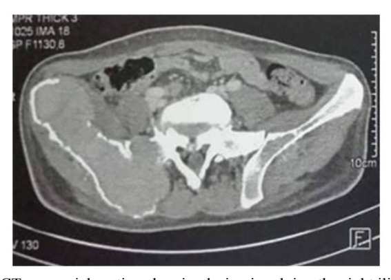
Figure 1: CT scan axial section showing lesion involving the right iliac crest

trating the pre-stylian, infra temporal fossa, the pterygoid muscles and the temporal muscle with discreet deviation of the oropharyngeal pathway to the right, it invades the ramus and the horizontal branch of the left mandible with rupture of the vestibular and lingual cortex (figure 3). The tumor invades the base of the skull with endocranial extension. No cervical lymphadenopathy was noted. Endocranial extension was noted with the invasion of the tent of the cerebellum on the left side, a lateral infiltration of the cerebral trunk, the pre-pontic and pre-peduncular cisterns. A core biopsy of the bone lesion was carried out and histopathologic analysis showed an invasive tumor, made by solid nests and cribriform areas. A clump of basaloid epithelial cells containing a fluid similar to mucus in the lumen was found out. This cribriform pattern of the lesion gave the entire structure a typical "swiss cheese" appearance. Atypical tumor cells were detected and immunohistochemical study revealed that tumor cells are diffusely positive C-kit (CD117). Based on the above features, the diagnosis of ACC of possible salivary gland origin was given (Figure 4). Based on the overall clinical, radiographic, and histologic findings, a diagnosis of metastatic ACC was made. The tumor was deemed unresectable, therefore palliative treatment by chemotherapy and radiotherapy was indicated. Unfortunately, none of these treatments was given and the patient died one month later.