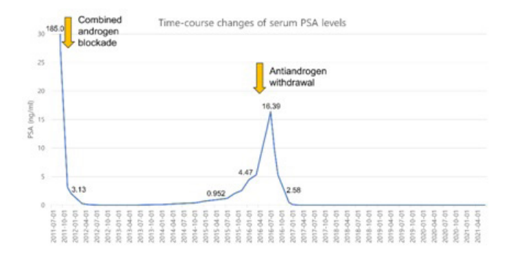
Figure 1: The kinetics of prostate-specific antigen during treatment

the left leg due to previous trauma (Figure 3). The author decided to discontinue bicalutamide to achieve an antiandrogen response. The patient's PSA decreased dramatically to 5.33, 2.16, and 0.491 for 3 consecutive months, reaching nadir again in August 2017. No other medications were administered to treat the prostate cancer, which remained well-maintained with a PSA < 0.003 until June 2021. About 9 years and 10 months after the initial CAB, the total testosterone remained at castration level and was 0.471 ng/ml in June 2021. In the present study, written informed consent was obtained from the patient to publish the present case report and any accompanying images.