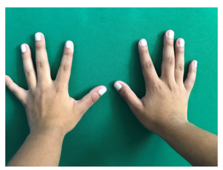
Figure 1: Leukonychia in the 10 fingers of the hands.