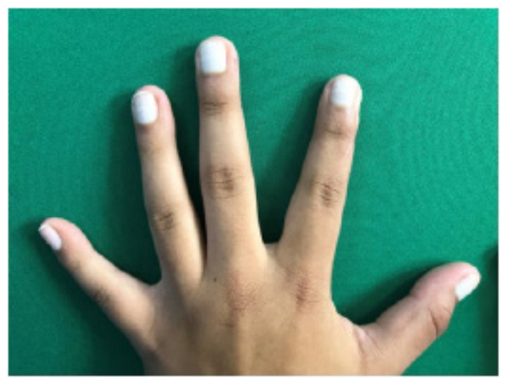
Figure 2: Close up photo of the true congenital luekonychia

Alterations of nail coloring are frequent consultations in the dermatologist practice. Leukonychia is part of coloration disorders, and it is described as the appearance of white macules on the nail plate. It is considered that pathophysiologically it is generated by an alteration of keratinization in the cells of the nail matrix with the persistence of parakeratosis and the presence of large granules of keratohyalin. Leukonychia can be classified according to the size of the lesion in leukonychia punctata, striatum, or totalis, or according to its origin in hereditary or acquired (Figure 3) [1,5].