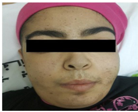
Figure 2: Centripetal fat deposition face, facial plethora, rounded face, buffalo-hump, face acne, Melanodermia