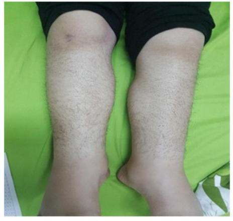
Figure 4: Legs Hirsutism

She had not palpable adenopathy. The abdomen was bloated. She had hepatomegaly with hepatic arrow of 20 centimeter, 2 lower limbs pitting edema. Her blood pressure was 11/9 with oliguria. Chest radiographf (Figure 5), Cerebral, Thoracic, abdominal and