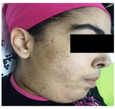
Figure 3: Centripetal fat deposition face, facial plethora, rounded face, buffalo-hump, face acne, melanodermia