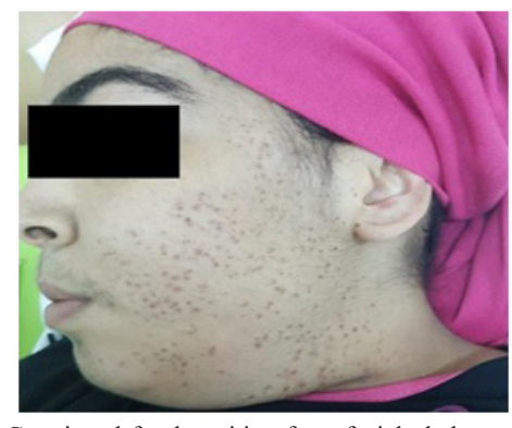
Figure 1: Centripetal fat deposition face, facial plethora, rounded face, buffalo-hump, face acne, Melanodermia

pnea. Clinical examination revealed an altered general state, obesity with centripetal fat deposition face, supraclavicular and dorsal and cervical fat pads, facial plethora, rounded face, buffalo-hump, face acne, melanodermia, capillary fragility, face, arms and legs hirsutism(Figure 1-4).