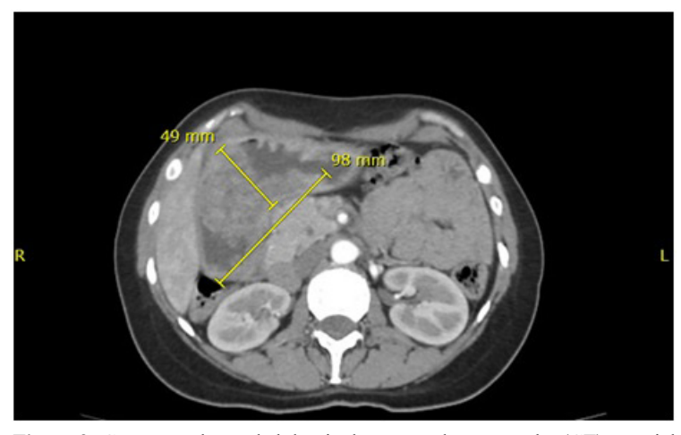
Figure 2: Contrast enhanced abdominal computed tomography (CT): arterial phase