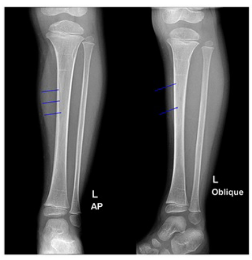
Figure 1: Obliquely oriented lucent line (arrows) in the proximal tibia in the anteroposterior and lateral radiographs of the left leg, presumed to be Toddler's fracture, in the child with related history, sign and symptoms.

depicted in the right proximal tibia with more vertical orientation (Figure 2c). The lines presumed to be irrelevant to the trauma, so the child was followed without any treatment. Clinical symptoms were resolved two weeks later.