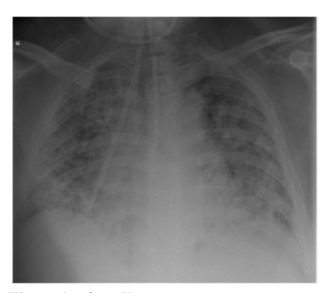
Figure 1: Chest-Xray

Due to clinical and biohumoral worsening (stable CRP at 24 mg/dl), tocilizumab (800mg) was performed on 03/24/2020 (no contraindication), after acquiring patient's informed consensus. The Resuscitation evaluation agreed for continuation of ventilatory support with the CPAP helmet.