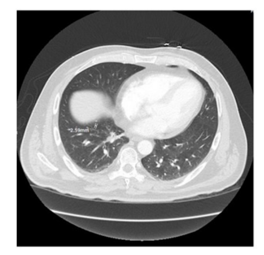
Figure 1: CT thorax showing a 4 mmand 3 mm pulmonary nodule at right lower lobe.