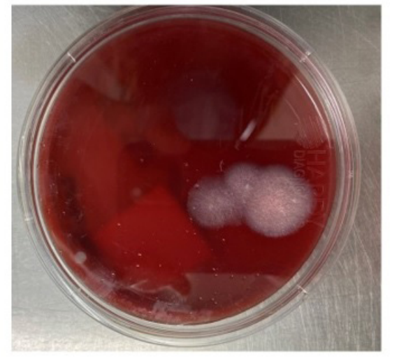
Growth on BAP from CSF

Figure 4: Growth on BAP from CSF, Coccidioides immitis identified on DNA probe.