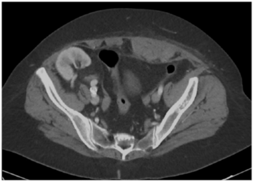
Figure 3: Abdominal CT scan, arterial phase. Left rectus abdominis muscle hematoma, confined to the abdominal wall. No active bleeding. Kidney transplant in the right iliac fossa.

patients receiving heparin thromboprophylaxis which showed that bleeding occurred also in only 5.6 %. Time-dependent predictors in this study were prolonged activated partial thromboplastin time, lower platelet count, therapeutic heparin, antiplatelet agents, renal replacement therapy and recent surgery, while the type of pharmacologic thromboprophylaxis was not associated with bleeding; patients with bleeding showed to have a higher risk of in-hospital death [12].