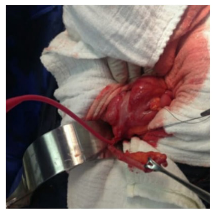
Figure 6: Cecostomy site