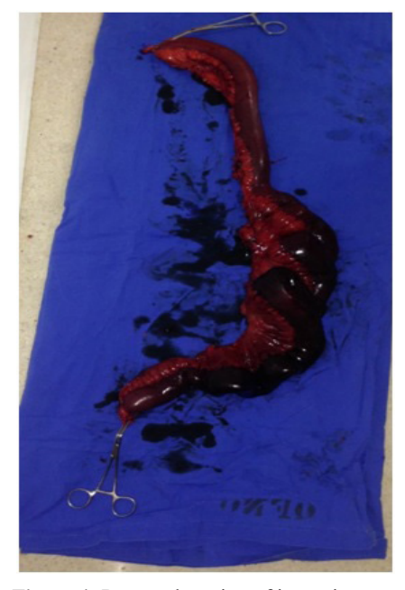
Figure 4: Resected portion of instestine