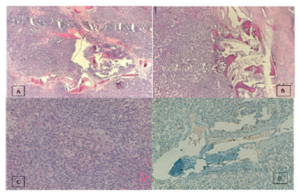
Figure 2: A) y B) HEx10: Renal cell carcinoma with focal areas of metaplastic bone formation advacent and intermingled with the tumor. C) HEx20: Histological section from the grown revealed features of clear cell carcinoma Furhman grade-1. D) HEx20: Inmunohistochemical for mieloperoxidasa with positive in focal erytroid cells in an area of bone metaplasia.

of metastatic disease at presentation. Currently, the patient remains free of recurrence of his disease and without metastasis (Figure 2).