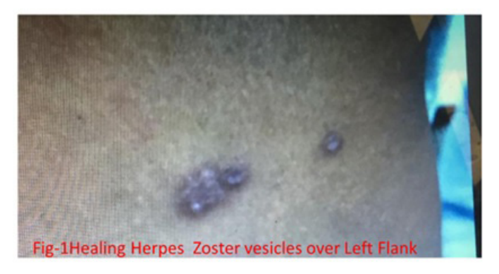
Figure 1: photo showing left flank abdominal bulge with the eruption of HZ

A 60-year-old male presented with a left lumbar abdominal wall protrusion in the surgery OPD department. He gave a history of Diabetes Mellitus. Eighteen days earlier, the patient had a painful skin rash without any prodromic symptoms. There was a history of skin vesicles and pustules' rapid eruption over the left T11-T12 dermatomes area. The patient was diagnosed with HZ and abdominal wall protrusion (Figure 1). There was no history of antiviral therapy was, and the shingles started fading. There was a history of the sudden appearance of a bulge in the left lumbar region. The bulge was painless, compressible, without any sensory deficit. It got prominent with the Valsalva maneuver.