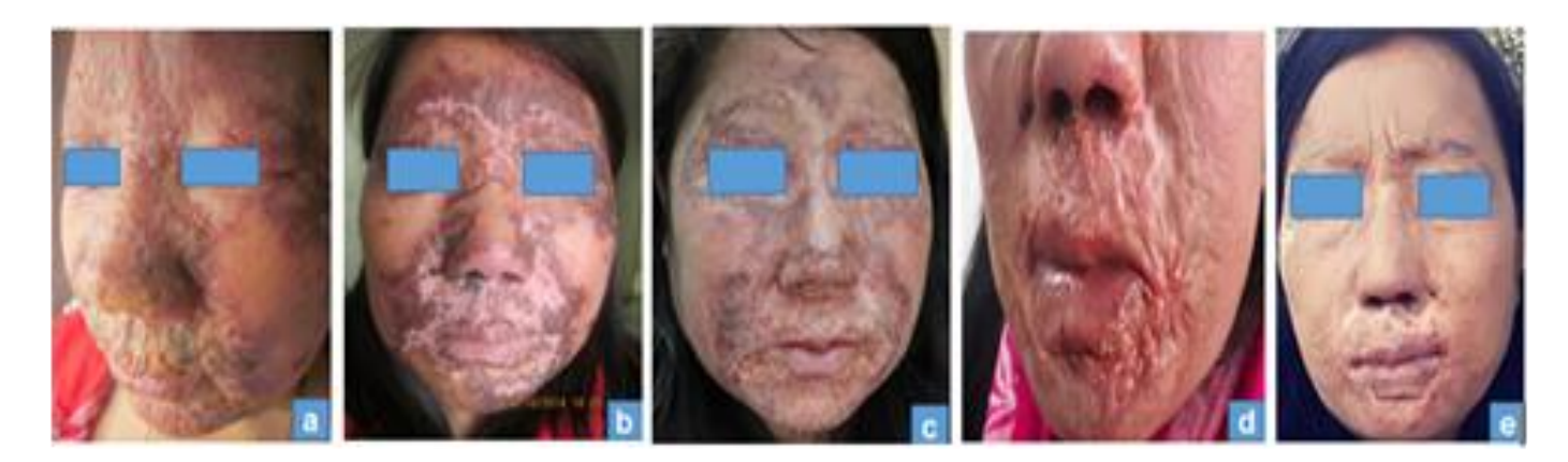
Figure 1: a) First presentation in 2014 with erythematous plaques with crusting and loss of left eye b) Marked improvement in 2014 after 28 doses of sodium stibogluconate (SSG)

She again visited the JDWNRH for follow-up in February 2019. New plaques were seen on the nostrils and chin with marked perioral scarring limiting the mouth movements (Figure 1d). SSS was negative for Leishmania parasites and skin biopsy showed dense granulomatous inflammation in dermis with lymphocytes, histiocytes and multi nucleated giant cells with histiocytes containing small particles suggestive of LD bodies. PKDL was diagnosed and oral miltefosine 100mg/day was started but reduced to 50 mg/day after a month due to severe nausea and elevated liver enzymes (transaminases). Treatment continued with the reduced dosage for further 2 months with clinical improvement (Figure 1e) and no major side effects.