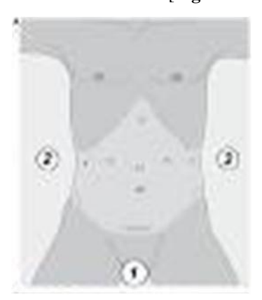
Figure 1: The mesh is placed on the hernia defect with or without tacks.Reduc-ingCO2tozerommHg leavingtheposteriorfascia and peritoneumtocom-press the mesh under the rectus muscles.

with themonopolarorbipolar device. Continuing first laterally to the right and left of the umbilicus under the rectus muscles just to the ribs unlike TEP: Reverse TEP. The hernia is left to the last dissection. After having formed the pre-peritoneal space by equalizing the epigastric vessels and the rectus muscles, applying blunt dissection to the ventral or incisional hernia without open-ing the peritoneum. Accurate revision of haemostasis. Reducing CO<sub>2</sub>to8mmHg. Themeshis placed on the hernia defect with or without tacks. Reducing CO<sub>2</sub> to zero mmHg leaving the pos-terior fascia and peritoneum to compress the mesh under the rectus muscles. [Figure 1 - 3]