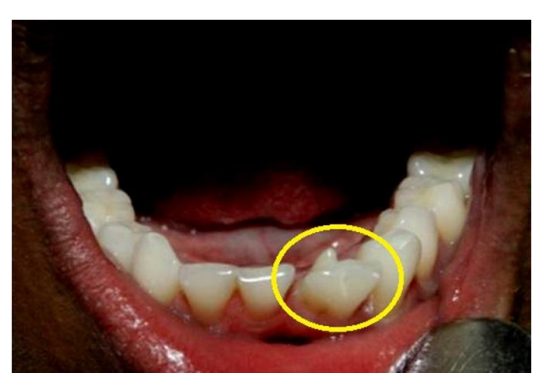
Figure 2: Talon's cusp on the lingual side of the 2 fused teeth (encircled)