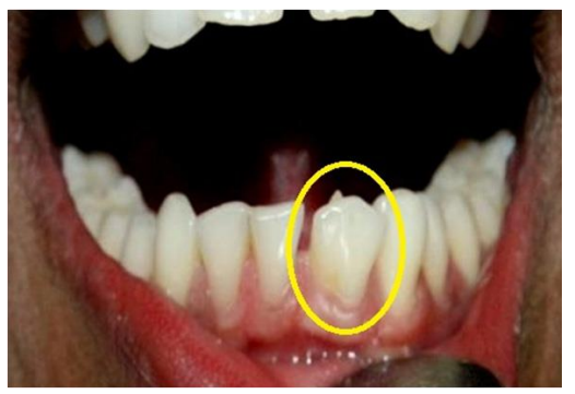
Figure 1: Fusion of mandibular left central and lateral incisors (encircled).

An intra-oral periapical radiograph for both the teeth was taken which revealed a radio-opaque area between the crown portion of both the teeth. Further, radiograph revealed no interdental space in between the teeth suggestive of fusion ( Figure 3 ).