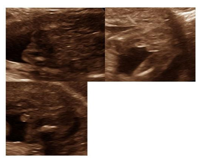
Figure 2: Antenatal ultrasound with failure to identify any specific foetal genital structures is suggestive of genital ambiguity.

Both foetal kidneys and bladder were visualized ( Figure 2 ) with normal echogenicity. On antenatal imaging we failed to identify specific foetal genital structures which suggestive of genital ambiguity.