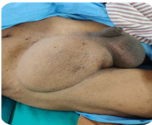
Figure 3: Giant Right Inguinal Hernia (Pre-Op) (After reducing)