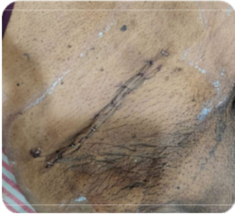
Figure 12: Wound Closure