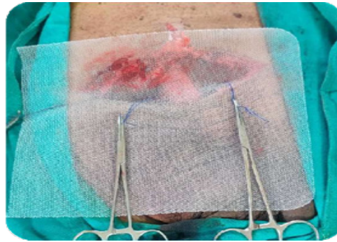
Figure 10: Placement of Mesh