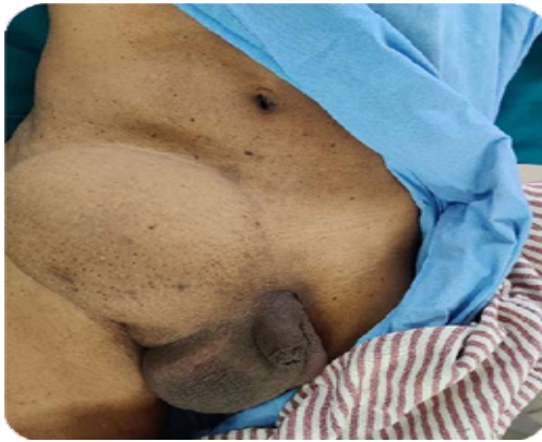
Figure 2: Giant Right Inguinal Hernia (Pre-Op) (Lateral View)