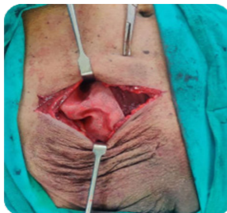
Figure 11: Placement of Mesh