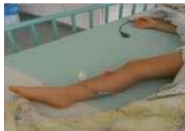
Figure 1: Intraosseous access outside of recommended site

Access was gained at first attempt at the right tibia (Fig 1). Hemodynamics could be stabilized (sinus rhythm 120/min, blood pressure 90/50 mmHg) after 1 l of crystalloids (given in a 20/20/20cc/kg manner) and under norepinephrine 0.2 \mu\text{g}/\text{kg}/\text{min} (forced by syringe driver to the bone). While oxygen saturation increased to 91% under oxygen insufflations the patient regained consciousness and opened his eyes to verbal stimulation. The team discussed the situation and the possible options.