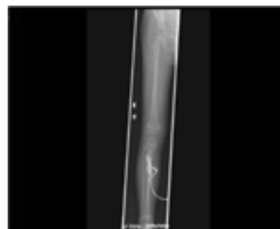
Figure 2: Contrast-enhanced X-ray of right leg: vascular spread